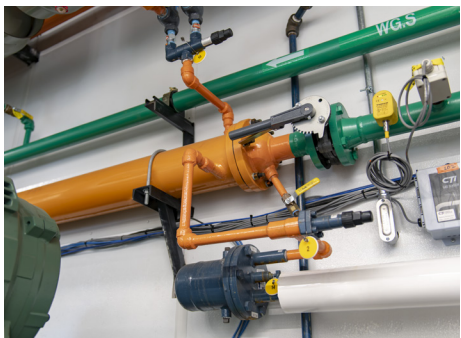
Heat Reclaim System