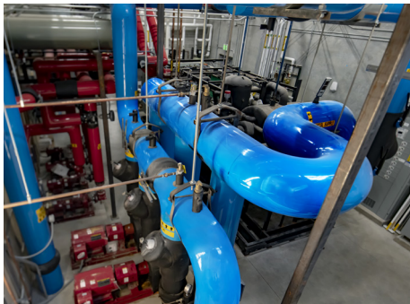
CO 2 Chiller