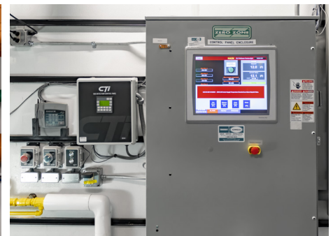
Chiller Control System