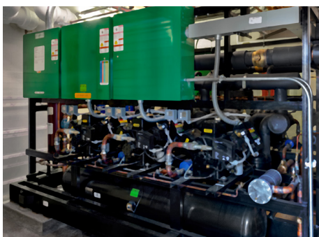
Synthetic Refrigerant Chiller