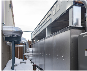
OPS Weatherproof Housing

Our chillers are customized to fit in your mechanical room or as an outdoor parallel system (OPS) in a weatherproof housing. We also build custom electrical mechanical centers (CEMCs) that are structurally sound exterior mechanical rooms, perfect for a smooth retrofit. Every configuration is designed for ease of installation and service accessibility.