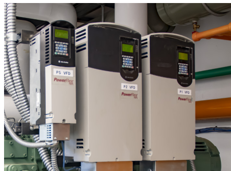
Variable Frequency Drives (VFDs)