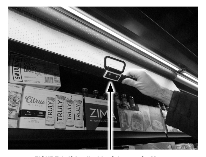
FIGURE 2: If Applicable, Orientate So Magnet Can Attach to Case