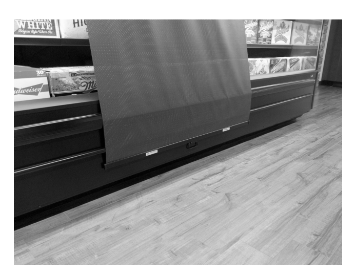
FIGURE 4: Night Curtain Pulled Down