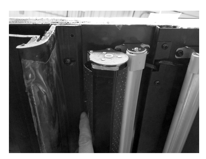
FIGURE 3: Tip Night Curtain Forward and Twist the Back into the Bracket