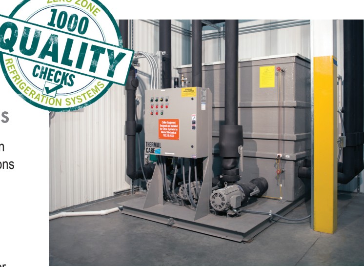
Chilled Glycol Pump Package