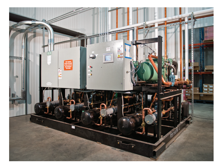
Industrial Chiller System

Key to the success of their HACCP plan is being able to assure that the system is running properly at all times. That is why they use a remote diagnostics system linked to the refrigeration