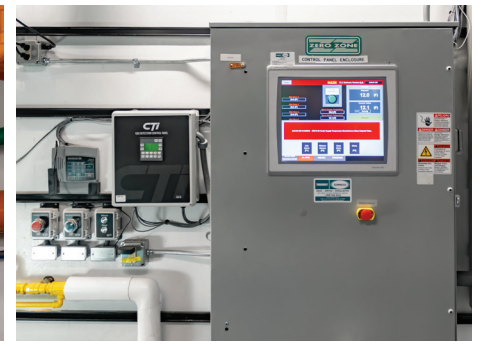
Heat Reclaim System