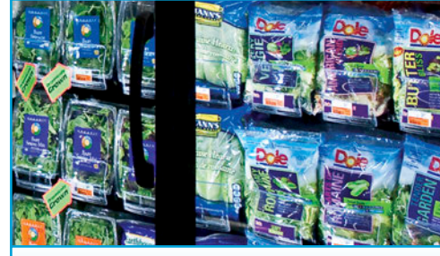
Self-Facing Salad Devices