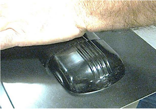
Bumper and End Cap