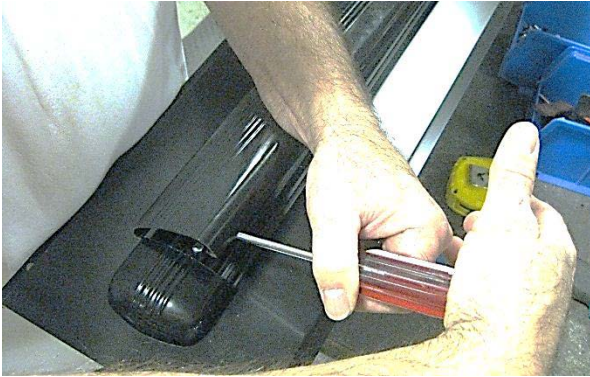
7-Pound screwdriver with hand or hammer to disengage opposite side of Bumper.