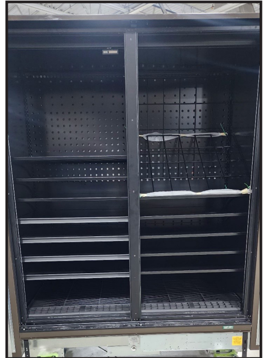
FIGURE 1: Grids Secured for Shipping